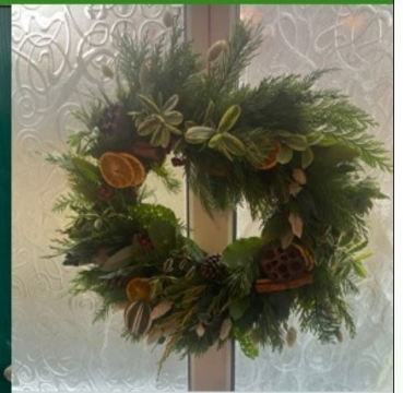
These are some of the ones made last year