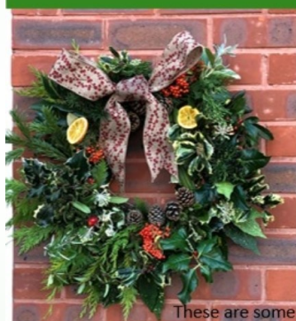
These are some of the ones made last year